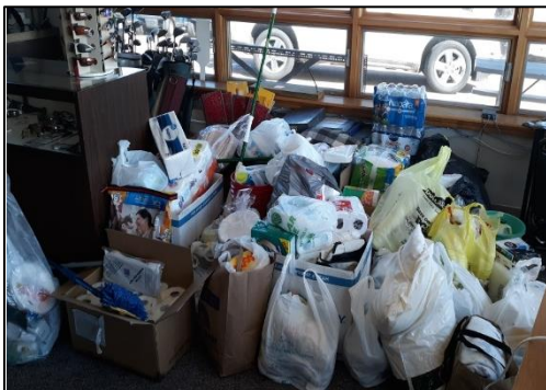
All the donations given for flood victims