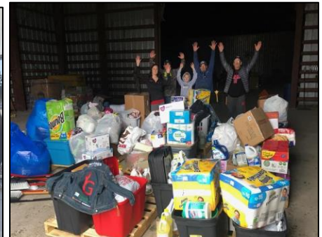
Donation Drop off site-Cajun Navy Supply with temporary site in Grand Island.

The Hastings Elks Lodge held a donation drive for recent flood victims during the last part of March. Participants were asked to donate much needed supplies, household items or monetary donations, and then dropping these items off at the lodge. On Saturday, March 30 th , some of the Hastings Elks Lodge Officers loaded all the donations up and hauled them to Grand Island for Missions in Nebraska sponsored by Cajun Navy Supply. These supplies will be going to locations in Northeastern Nebraska. Please visit their website at cajunnavysupply.org to volunteer, request supplies or find a donation location! Monetary donations were given to the Nebraska State Elks to be distributed to areas in need.