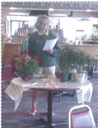
An Earl May representative spoke about the care of our indoor and outdoor potted plants.

This has been a fun project and very rewarding. We will have one last cooking class in June and they asked to learn some easy baking!