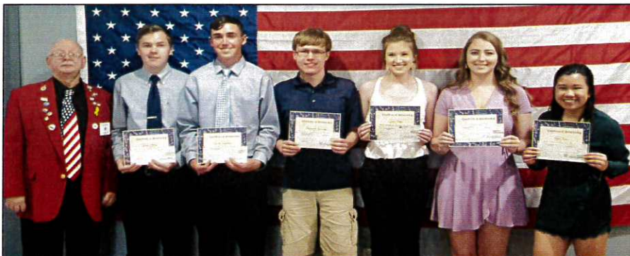
2017-18 Elks National Foundation Scholarship Winners