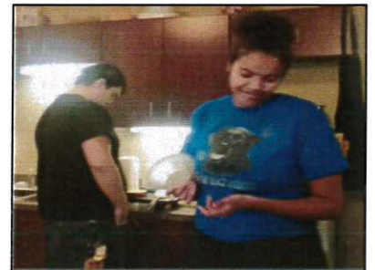
Two residents of Maryland Living Center getting ready to eat what they fixed in their first cooking class

coming back until May. This was a great group of kids, and we all really enjoyed the experience.